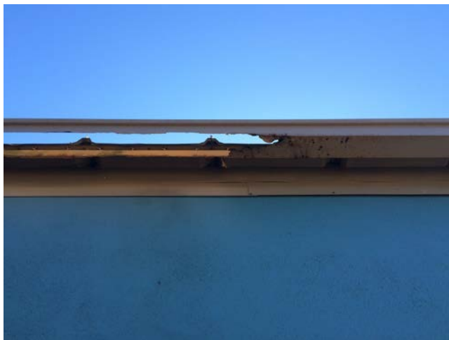
Hole in the gutter system.