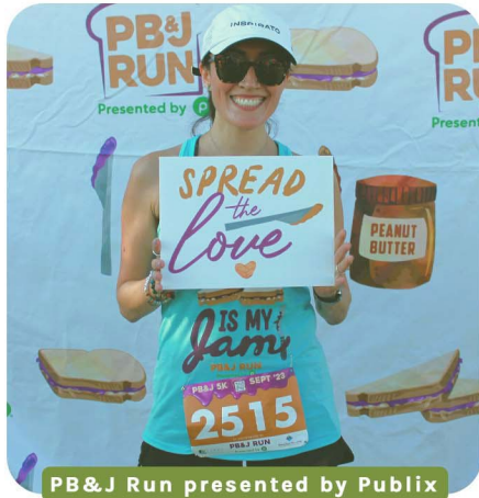
PB&J Run presented by Publix