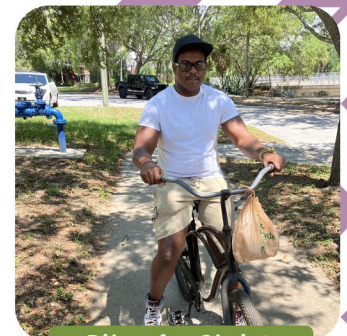
Bikes for Christ