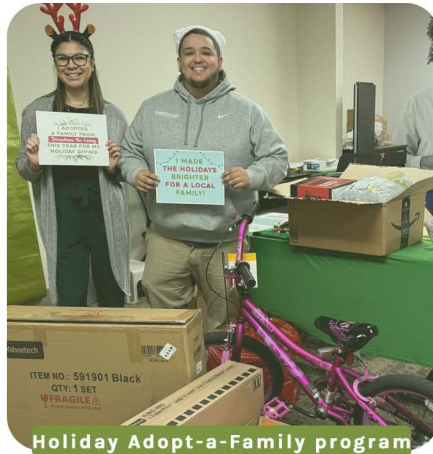
Holiday Adopt-a-Family program